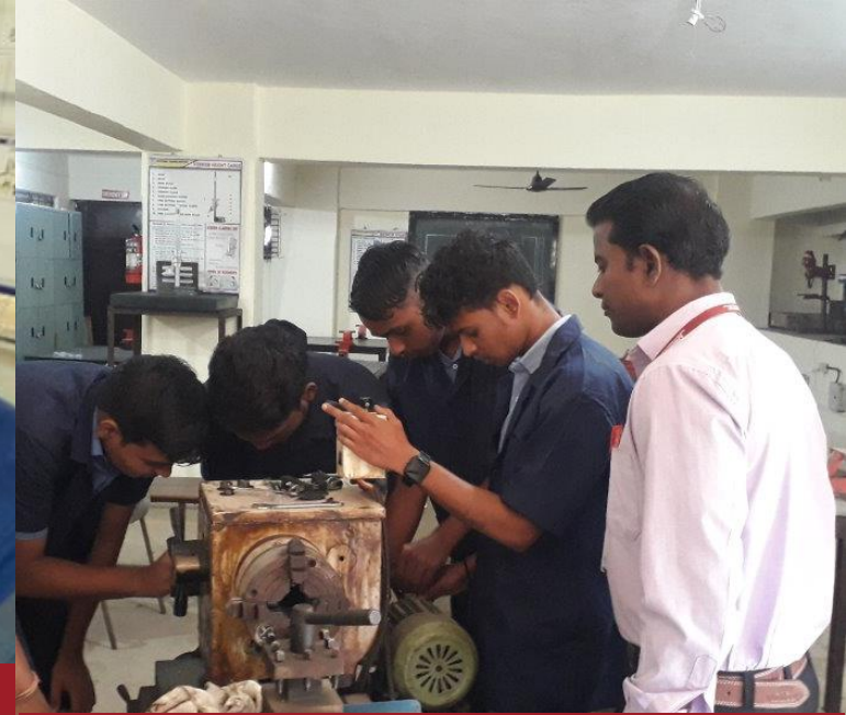
Students attending Welder Practical class