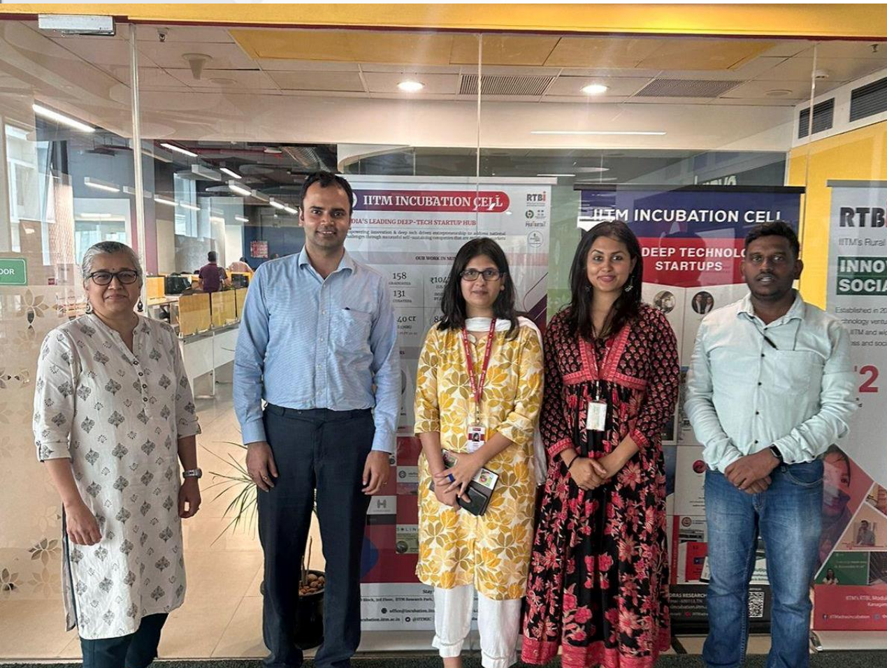
CSR & data Analytics Team meeting with DSE Team to explore collaboration in CSR Space