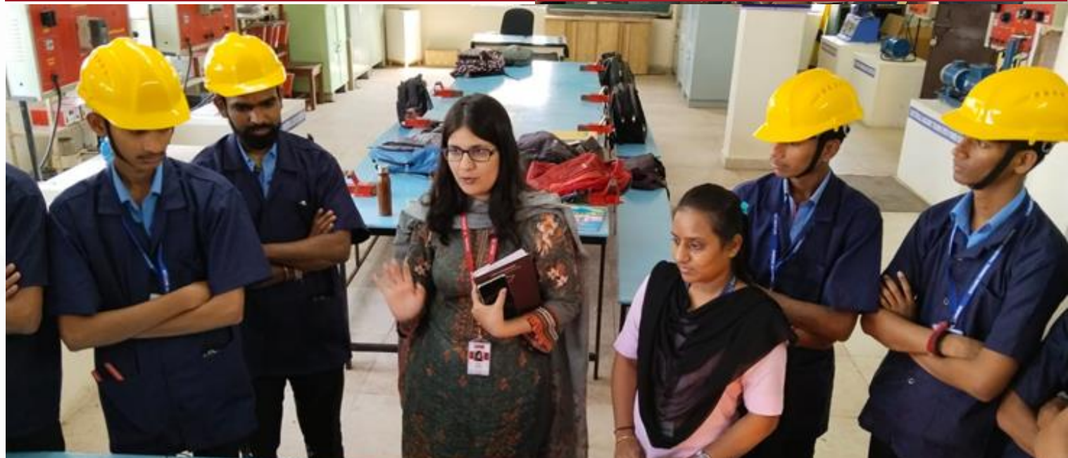
CSR Team meeting with Students of Electrical department at SAMPARC