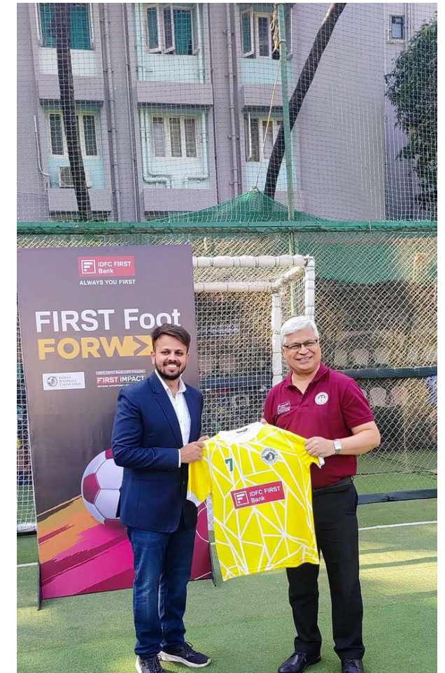
CHRO with team FIRST Foot Forward Scholars & of IFF