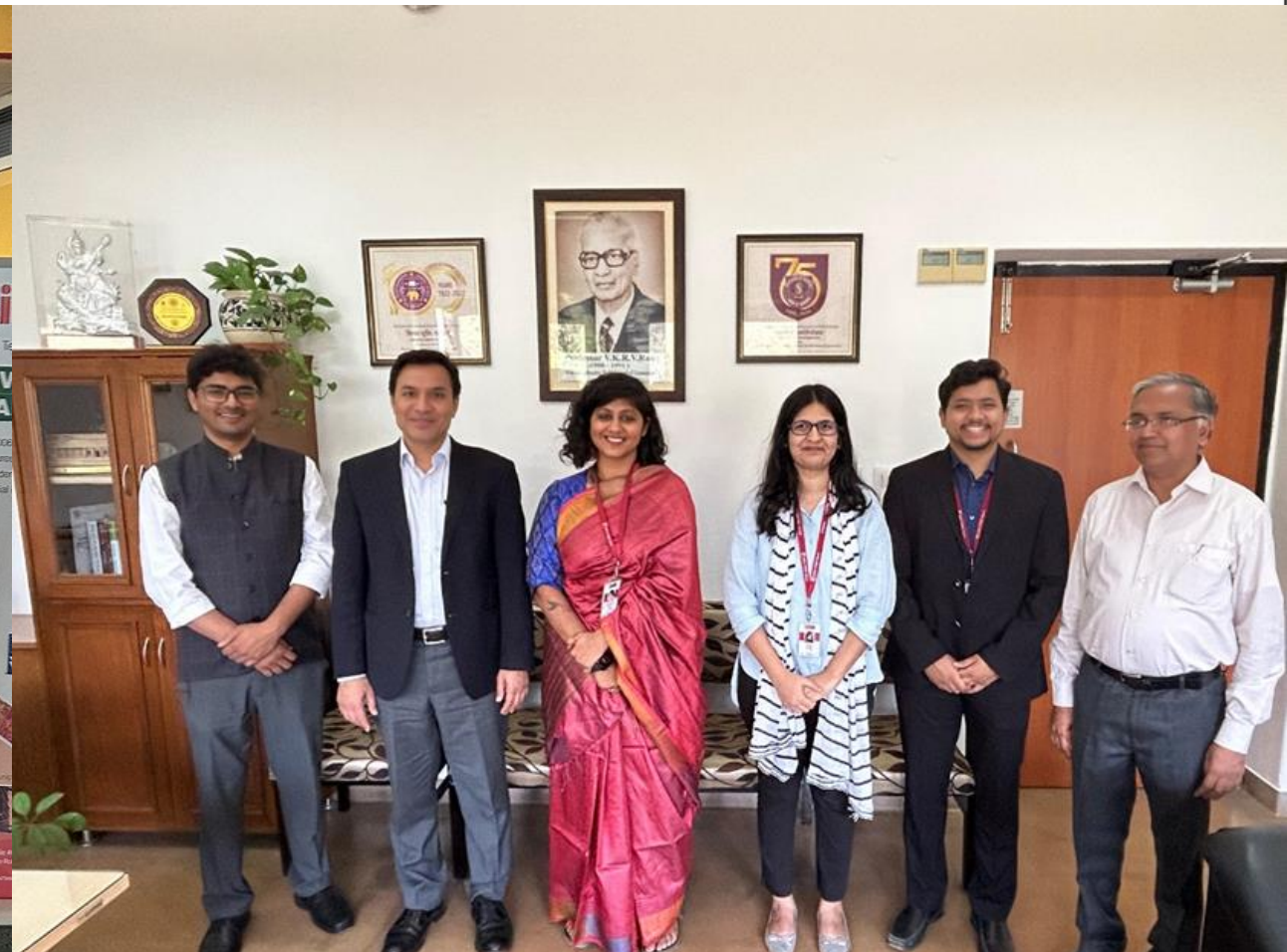
CSR Team meeting with IIT Madras Incubation team to explore possible opportunities for collaboration