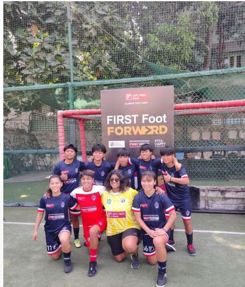
CSR Head with team of FIRST Foot Forward Scholars